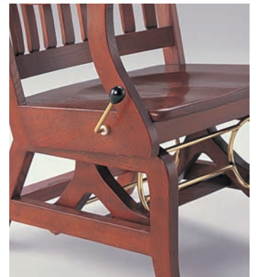
Rocker Motion Lock Mechanism

Constructed of solid beech with dowel and pinned mortise and tenon joinery, glued and screwed assembly. Patented sealed ball bearing mechanism produces a true rocking, not gliding, motion. Available with side panels and locking mechanism.